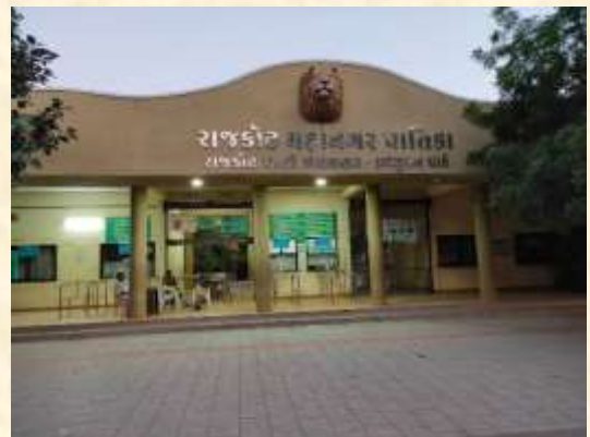
Pradhyuman Zoological Park