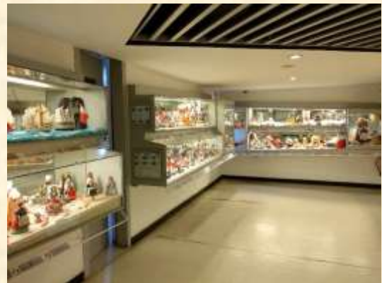
Rotary International Dolls Museum