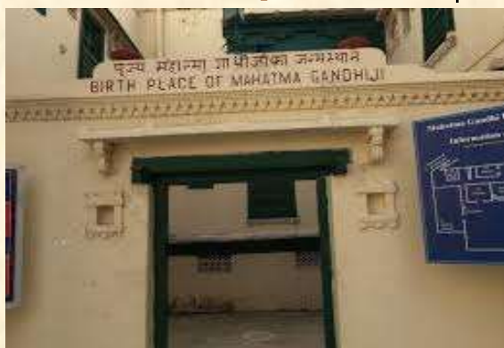
Gandhiji's Birth Place- Porbandar – 180 KM