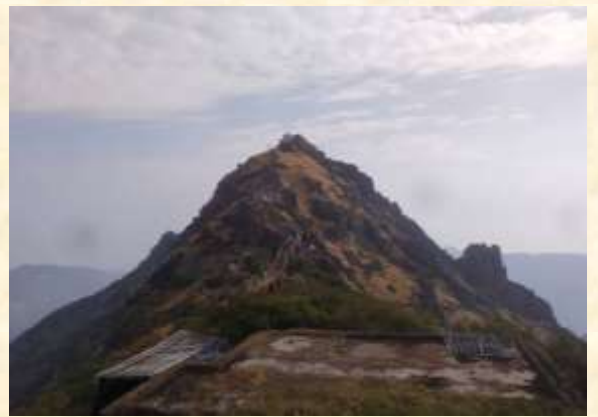
Girnar Mountain – 106 KM.