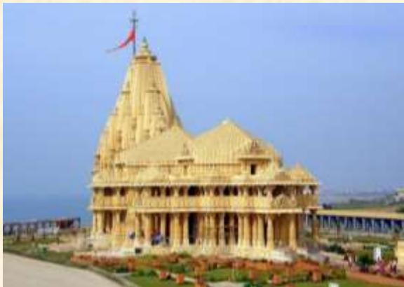
Shree Somnath Temple – 139 KM