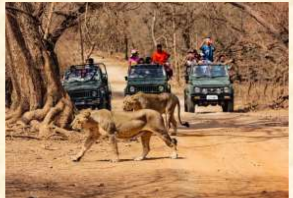
Gir Lion National Park – 170 KM