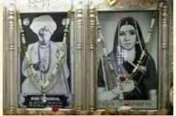
Jalaram Bapa Temple- 55 KM