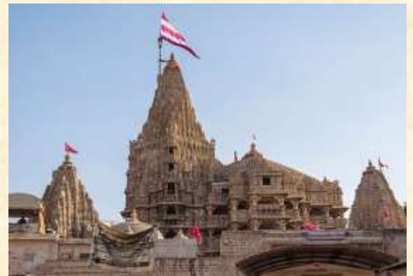
Dwarkadhish Temple - 235 KM