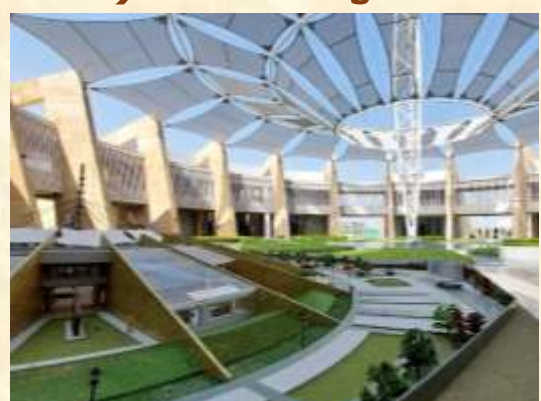
Regional Science Center