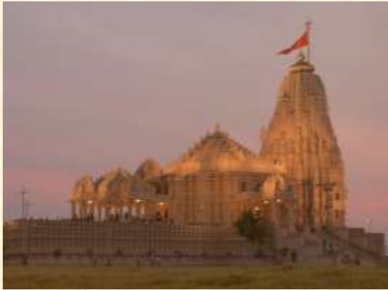
Khodaldham Temple – 63 KM