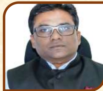
Shri Dilip Rana (IAS) Commissioner of Higher Education CEO, KCG Govt. of Gujarat