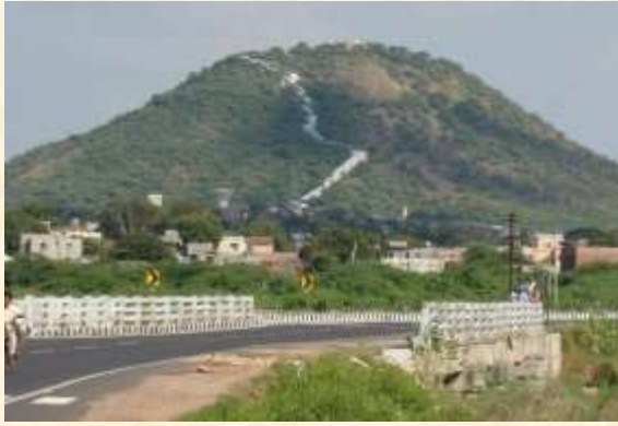
Chotila Chamunda Ma Temple – 50 KM