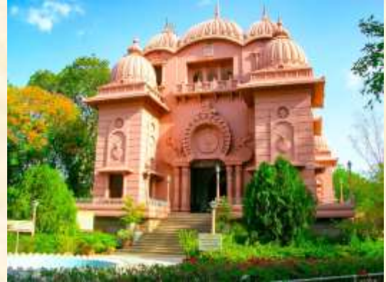
Shri Ramakrishna Ashram