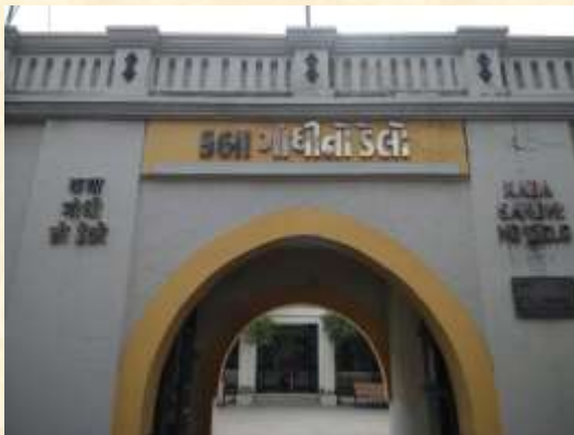
Kaba Gandhi No Delo (Mahatma Gandhi's Residence)