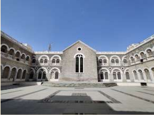
Mahatma Gandhi Museum